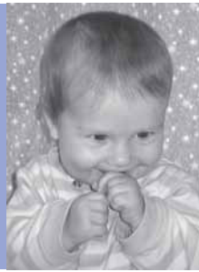
Madison, 7 months